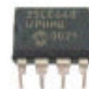
EEPROM 25LC640 chip